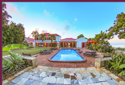
Backyard & pool deck