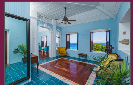
Bridal suite powder room