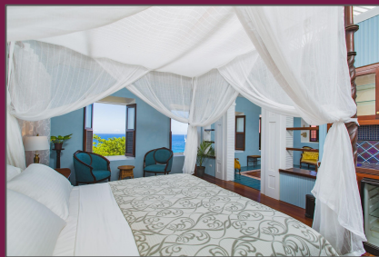
Bridal suite bedroom