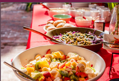
Fresh & local catering